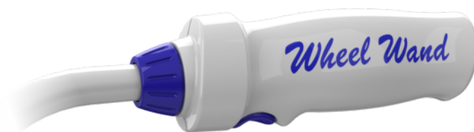
High-Quality 3D Rendering

Hollywood Concept Models and Sell Sheet Ideal For: Inventors