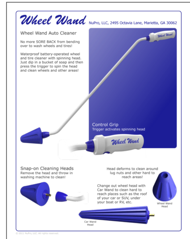
Hollywood Sell Sheet